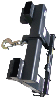
Lift Hooks - Lift up to 22,000 lbs Safely and securely

Customers Who Bought this product also bought