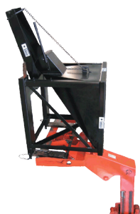
Concrete Hoppers - Turns Your forklift into A concrete placer.

Visit www.starindustries.com or call us at 800-541-1797 for more information on these and other great products.