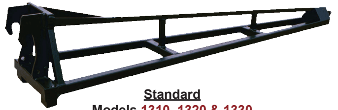
Standard Models 1310, 1320 & 1330