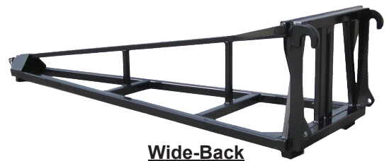
Wide-Back Models 1325 & 1335