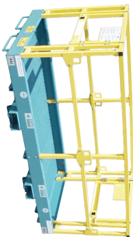
Safety Work Platforms - Turn your forklift into an Aerial work platform